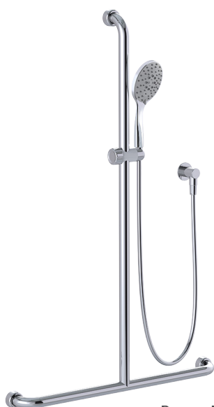
Drawn MF (Middle Fix)